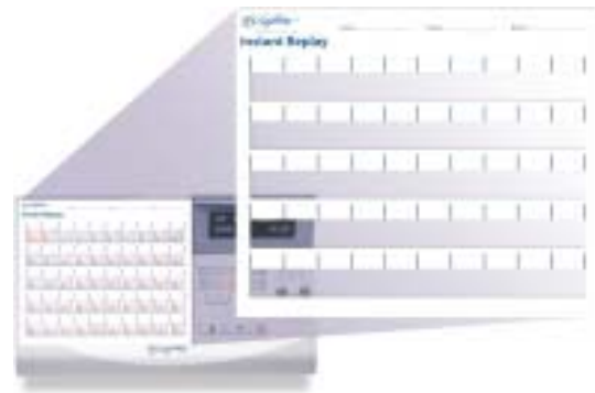
Keyboard Legend Overlays